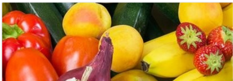
Of Risk, Residues, and Roundup™: Confusion