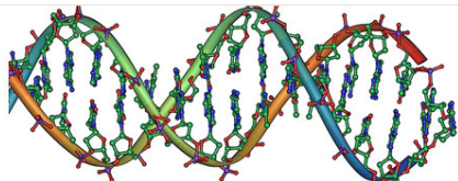
The Holocaust, Epigenetics, and Unclear