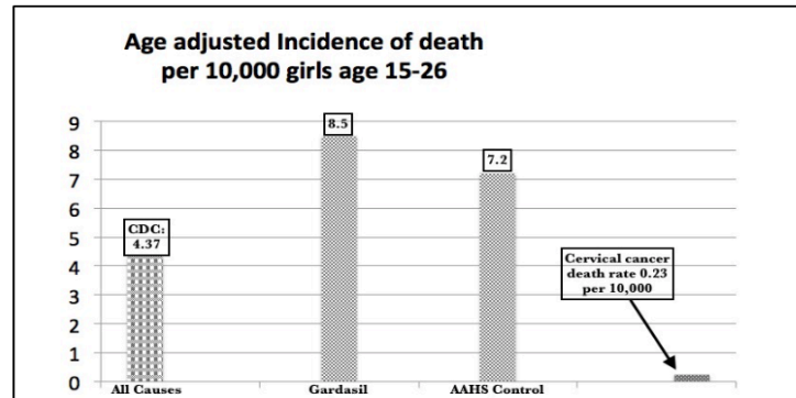
Background CDC rate 4.37 source: National Vital Statistics Report Vol. 53 2002 page 24. 37 Gardasil rate 8.5: 10/11,778. AAHS control rate 7.2: 7/9,680 38 Cervical cancer mortality: 2.3 per 100,000 source: National Cancer Institute SEER Cancer Statistics Review 2015 39

293. When Merck added in deaths from belated clinical trials, the death rate jumped to 13.3 per 10,000 (21 deaths out of 15,706).